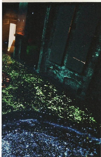
Left: Richard Purdy, Bindu: The Big Bang , 2010. 40,000 fluorescent elements, rain-making system and mixed media, 6,571 sq. ft. Below: Douglas White, Black Sun , 2010. Tire, yew root, steel, and MDF, 209 x 364 x 84 cm.

back on view at Shawinigan Space through September 25.